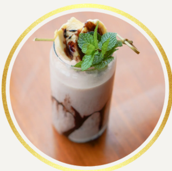
BANANA LORD SMOOTHIES