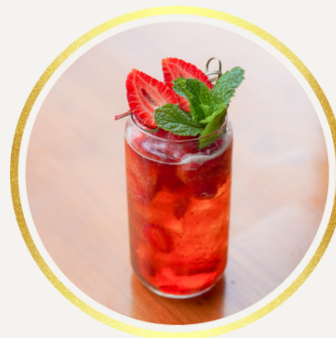
STRAWBERRY ICED TEA