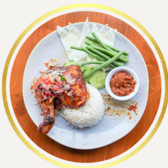
AYAM BAKAR MADU